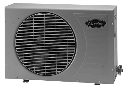
38 CF/CH - Outdoor unit